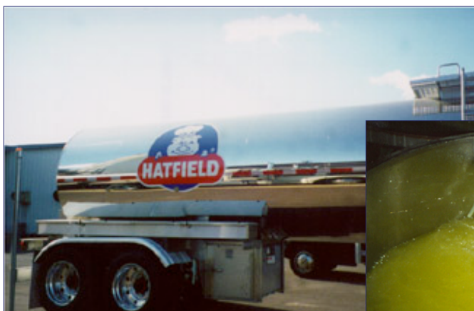
Hatfield Finished Lard

Penn State is developing technologies to retrofit boilers, gaining expertise in integrating hardware to achieve fuel flexibility in boilers, and generating a database of fundamental pyrolysis, combustion, and ash chemistry interactions of biofuels. Penn State is working with industry to evaluate nontraditional fuels – e.g., animal wastes, rendered products, woody and herbaceous by-products, animal-tissue biomass (ATB), RDF pellets – fuels that are being considered to replace natural gas and fuel oils in boilers due to the demonstrated price volatility associated with the gas and fuel oils. Biofuels are being evaluated for use in both industrial and utility boilers and, depending on the fuel characteristics, in watertube, firetube, and fluidized-bed boilers.